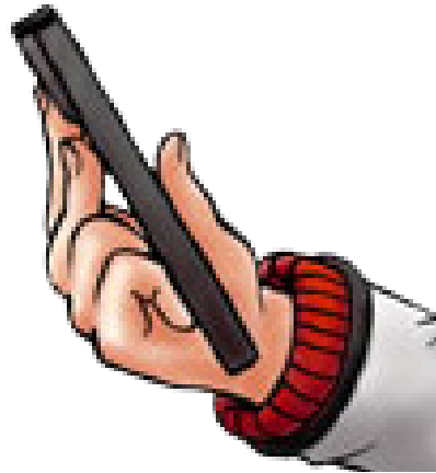
SITS2 Drawing. Note the original red cuff has been eliminated by BuNine.